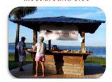
Meet around 5:30