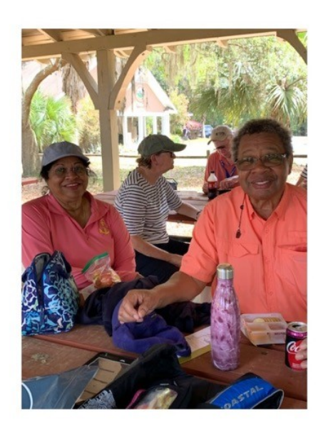
Beautiful Spot For a Picnic