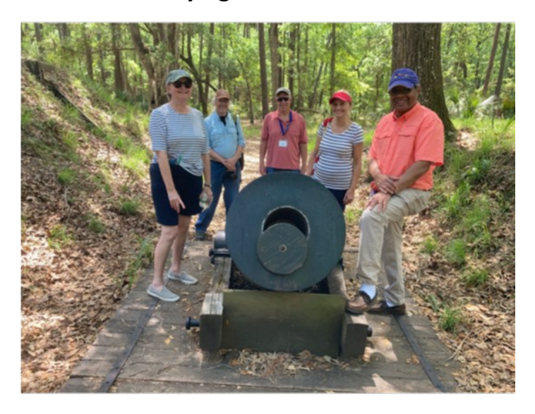
Small But Mighty – Mortar being viewed by the few SIBC members who ventured far afield.