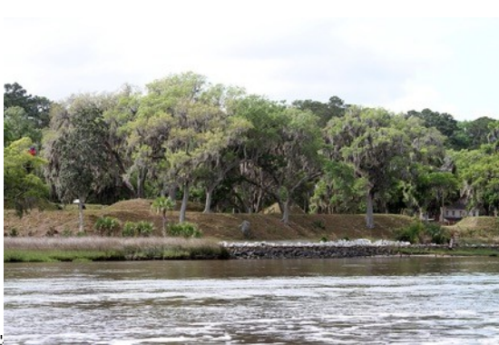
SIBC Flotilla Course to Fort McAllister