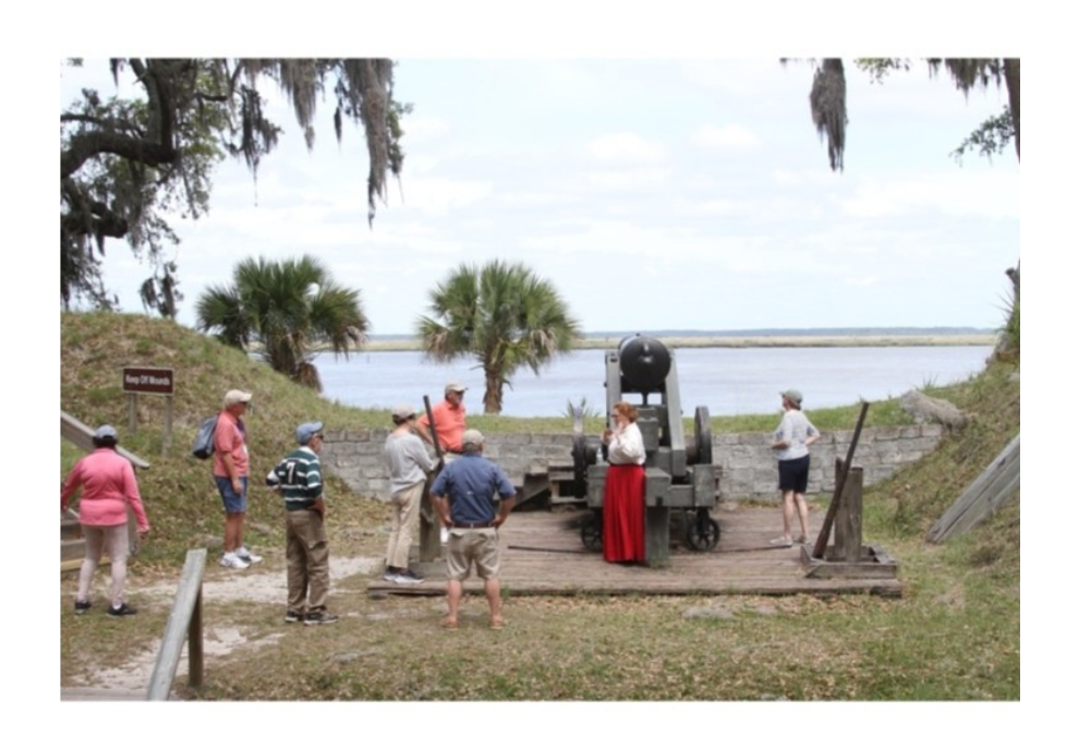
One Stop on the Guided Tour...SIBC Members Surveying the forts BIG Guns